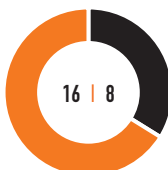
SHOTS OFF TARGET