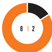
SHOTS ON TARGET