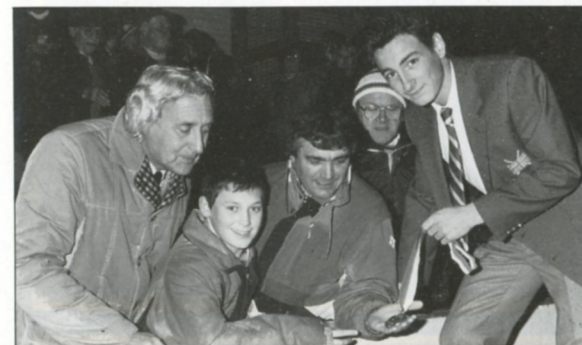
• Pure gold: Our highly-successful gold medal winning Olympic hockey team were with us at Kenilworth Road on Tuesday and our own fans enjoyed a chance to examine their special medals.