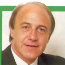
by BILL TOMLINS