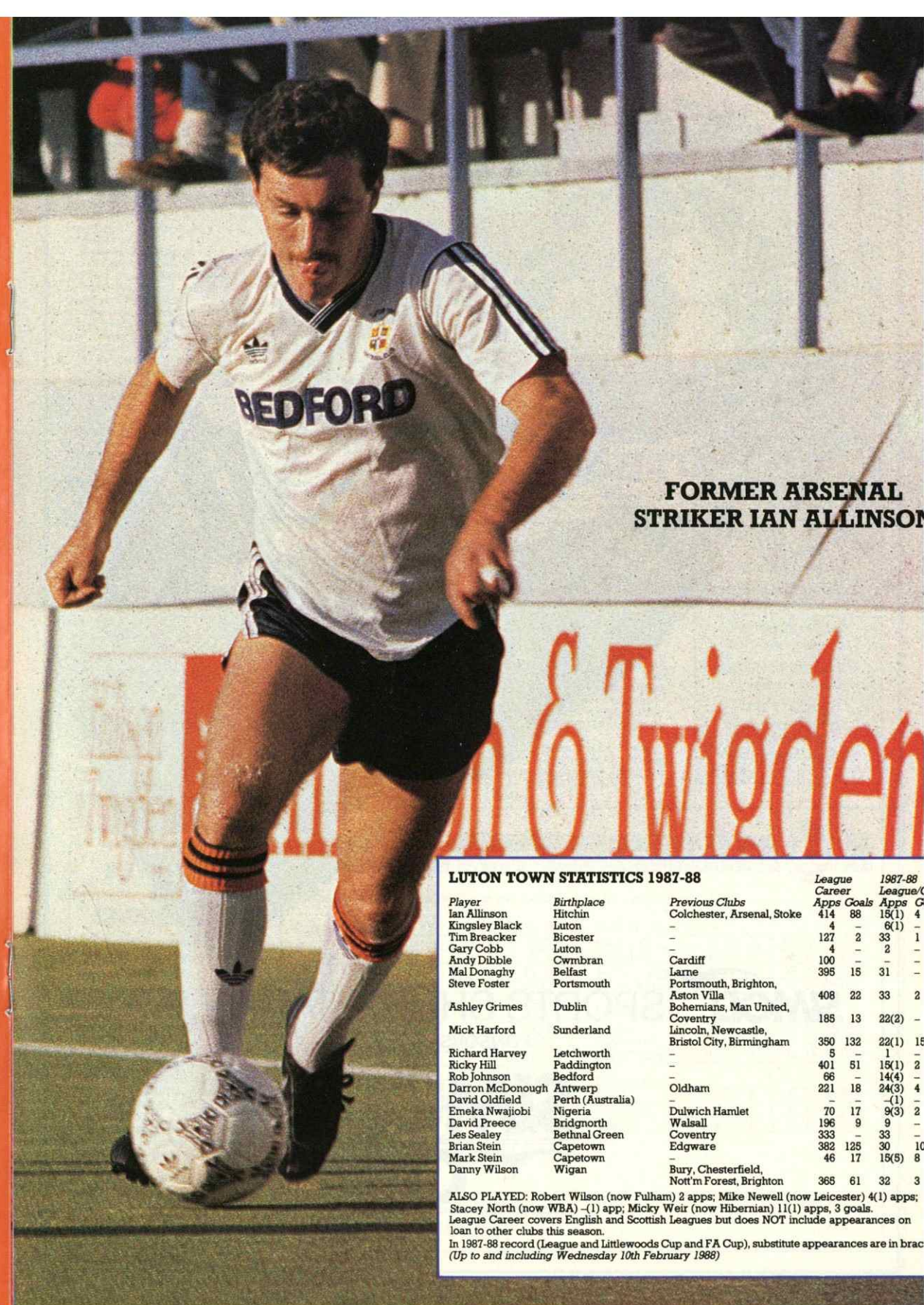
FORMER ARSENAL STRIKER IAN ALLINSON