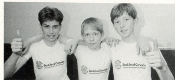
●The big match: Nearly 300 pupils from six Luton schools have competed in a challenge tournament sponsored by SunLife of Canada and our caterers SGL. The final is tonight - our big match pre-match entertainment.