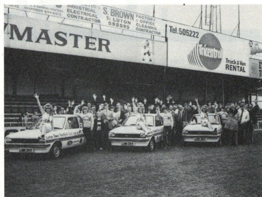
Tricentral, the match day sponsors for the West Ham game, used the occasion to unveil three of the seven cars they presented to the club in a £50,000 deal announced a few days earlier. The cars, Tricentral officials and their guests, are pictured on the pitch before the game.