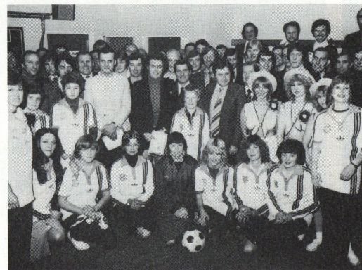
The company's guests were also treated to a guided tour of the stadium before both teams reported before the kick-off. This happy group is pictured in the dressing room before the match.