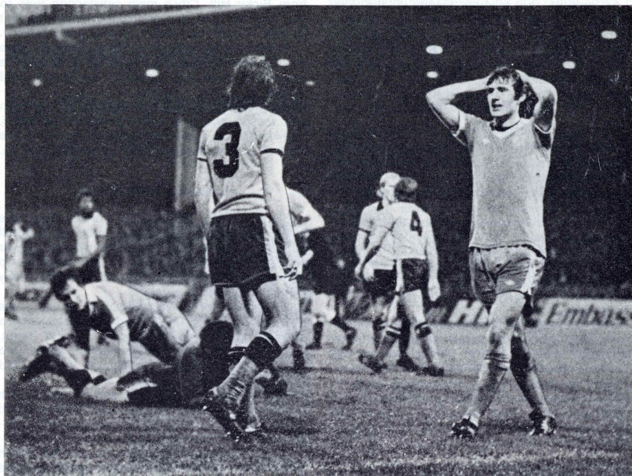
MANCHESTER CITY 0, LUTON TOWN 0.

He says promotion is Luton's main ambition, but he isn't exactly against a good run in the League Cup. "It sets the air tingling," is how he puts it.