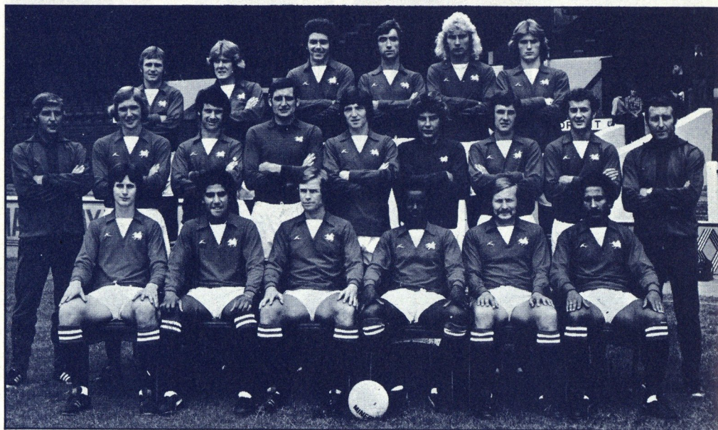
ORIENT FOOTBALL CLUB—SEASON 1975-76