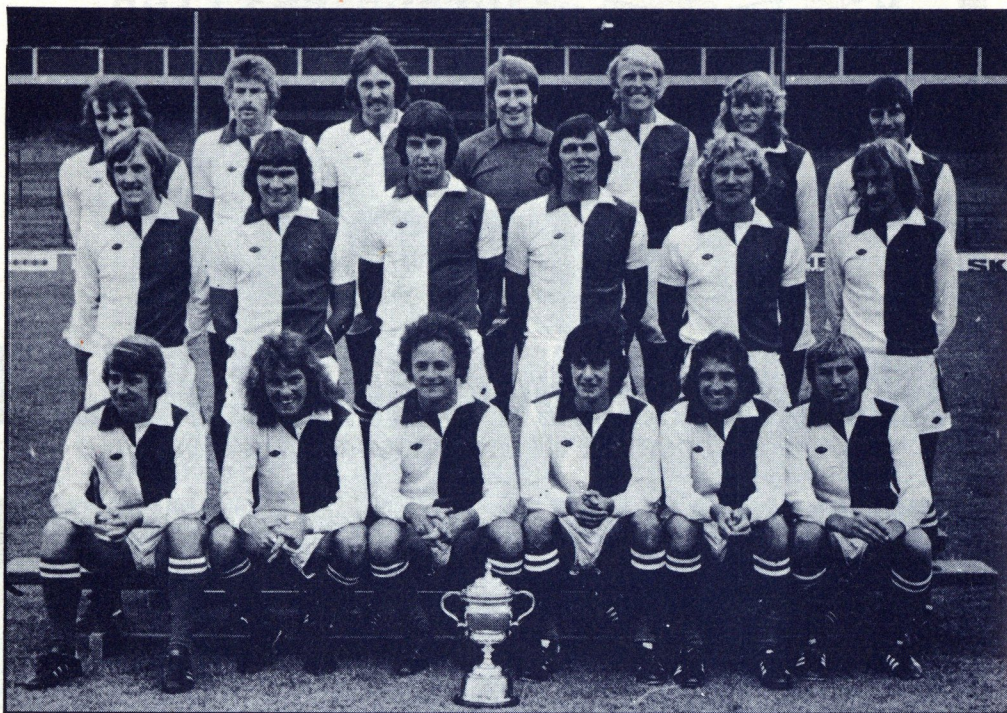
BLACKBURN ROVERS FOOTBALL CLUB—SEASON 1975-76