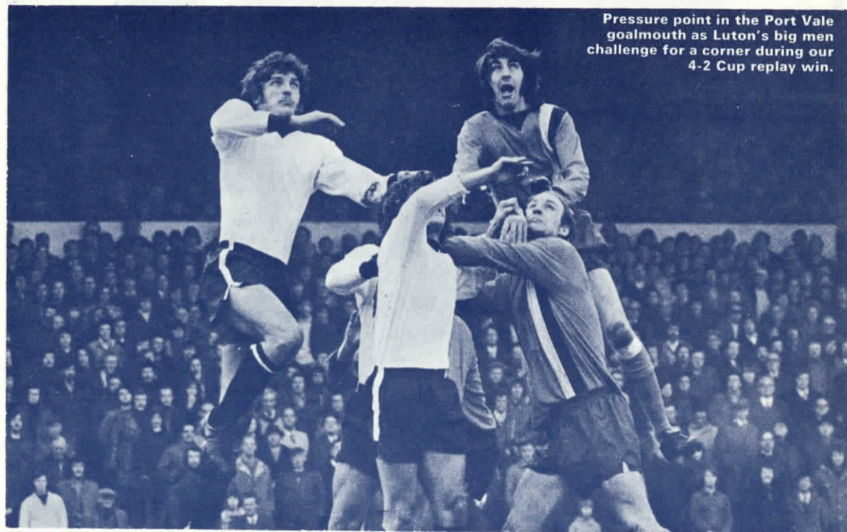
Pressure point in the Port Vale goalmouth as Luton's big men challenge for a corner during our 4-2 Cup replay win.