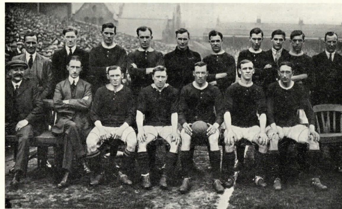
VICTORY CHAMPIONS 1918/19