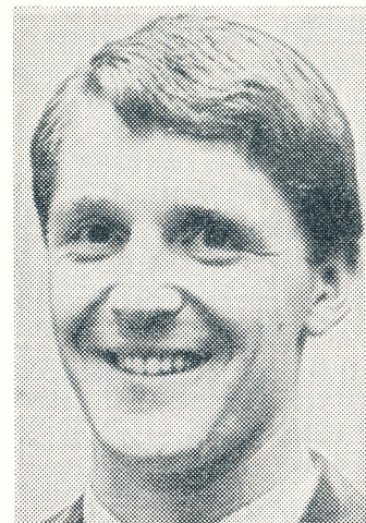
under over half a dozen managers, he joined Crewe Alexandra in 1962.