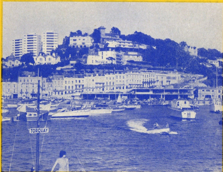
THE HARBOUR, TORQUAY