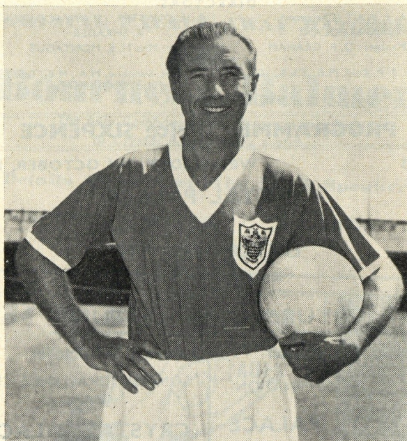
STANLEY MATHEWS, C.B.E.

The senior professional in English football; was born in Hanley Stoke, played his school-day football in Stoke, joined Stoke on leaving school and is now a Freeman of that City. Played his first League game at seventeen, versus Bury in 1937, and has now played over 680 League games (70 goals), 82 F.A. Cup-ties (8 goals) and has one Cup Final medal won with Blackpool in 1952-53.