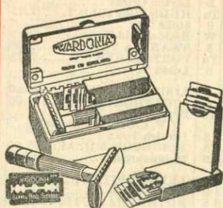
10/6 Devon Set Buy one on your way home

10/6 "DEVON" SET contains one Wardonia Razor Holder and 10 Blades in Ivory plastic Case : neat, compact and strong. Another good seller is 5/6 Ivory "Rugby" set , with 5 blades. From Boots, Woolworths, British Home Stores, Timothy Whites, and all Good Class Stores and Shops everywhere.