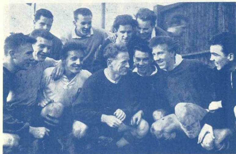
NOW — Twenty-two years later—Tom Finney with the North End Juniors of 1960—including some of the present F.A. Youth Cup Final side.

Official Suppliers to Preston North End F. C.