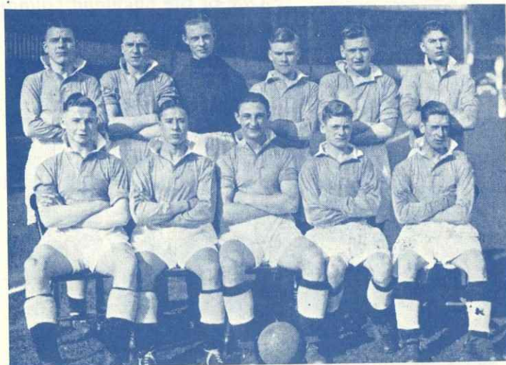
THEN — Tom Finney (4th from left, front row) in the North End Junior team of 1938—aged sixteen years.