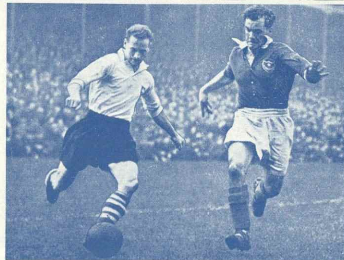
Tom Finney makes for goal—one of countless impeccable memories of a legendary footballing wizard.