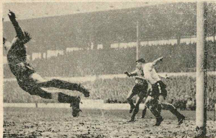
A dangerous moment in the Luton goalmouth as Baynham makes a flying leap to a cross from the right.