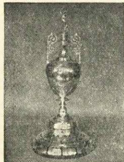
League Champions 1955