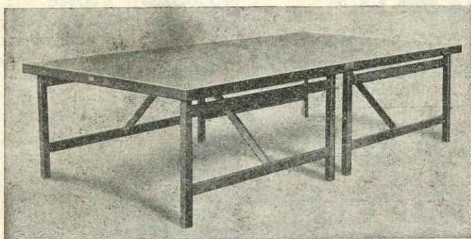
TABLE TENNIS TABLES AND TOPS

8 ft. x 4 ft. £18.15.0 9 ft. x 5 ft. £25.10.0, £27.12.6