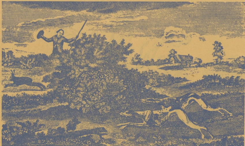
'Coursing the hare'—From an old print