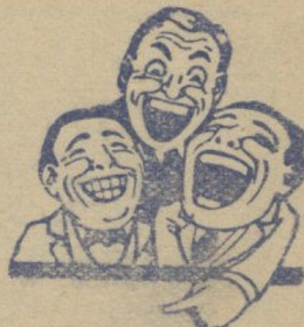
"Hurrah ! Two more points"