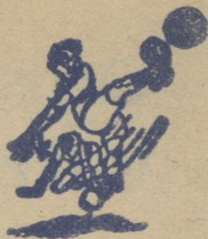
"What a clearance"

Broomhead Bros., Ltd., Printers, Packers' Row, Chesterfield.