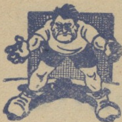
A Goal-keeper's Dream.