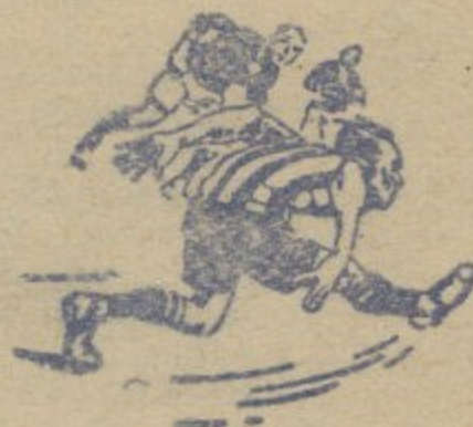
"Go on, Shoot!"