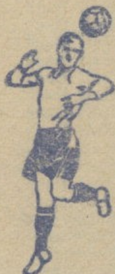
"Nodding 'em in!"

They may be good these Luton Hatters, But the result of the game is all that matters ; If they beat our lads right under their Spire, They will well earn the points we both require.