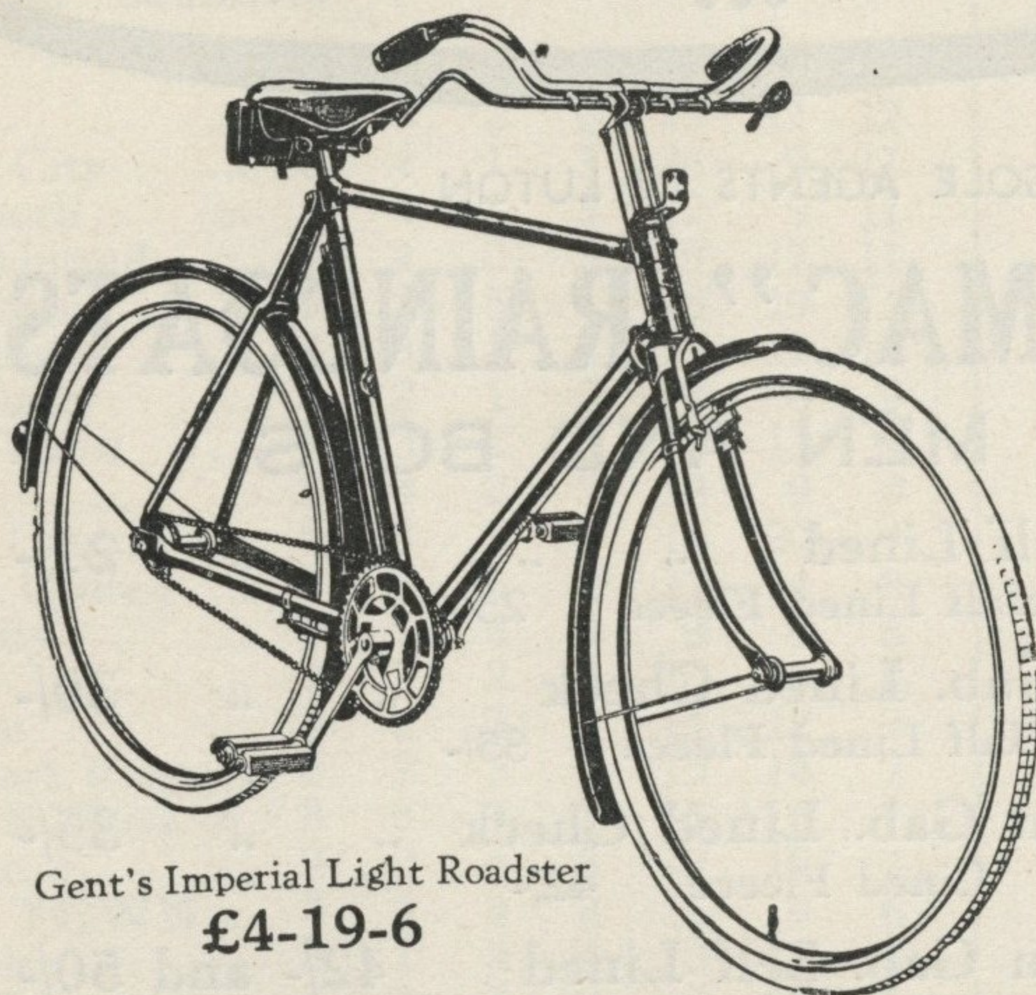
Gent's Imperial Light Roadster £4-19-6

Thousands of Cyclists in every part of the world ride NEW HUDSONS for pleasure, sport, business and touring. They know the unapproachable value of NEW HUDSON'S. Follow their example this Summer. Choose and ride NEW HUDSON, the better cycle for happier cycling. There is a huge range of models to choose from, and the easiest of easiest terms, backed up on wide experience of the cycling trade.