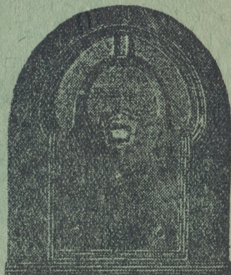
MODEL 56 BABY GRAND 16 GNS.